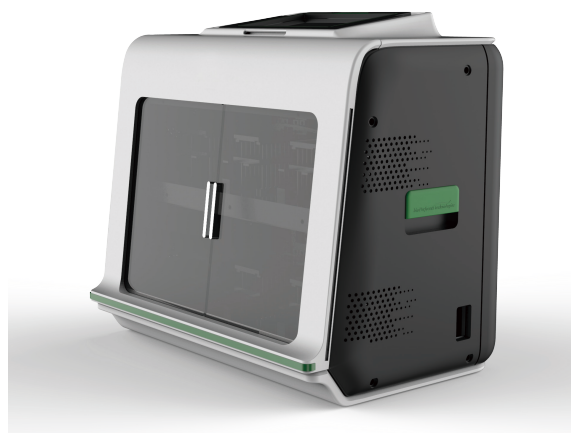
SSNP-9600A (96 channels)