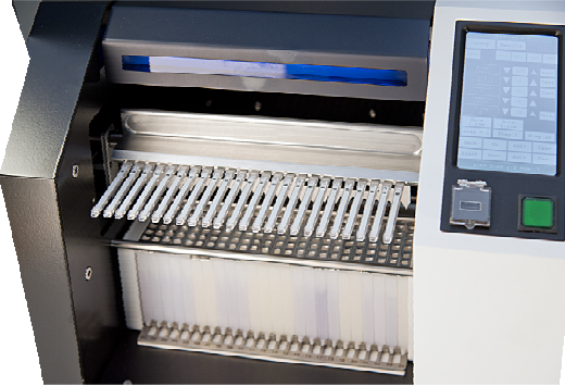
Insertion of strips and reagents