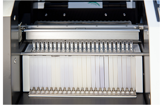
Incubation and washing